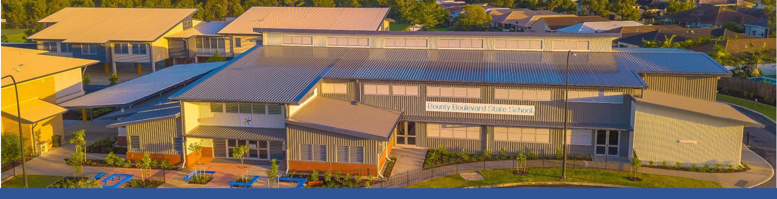
Term 1, Week 8 2024