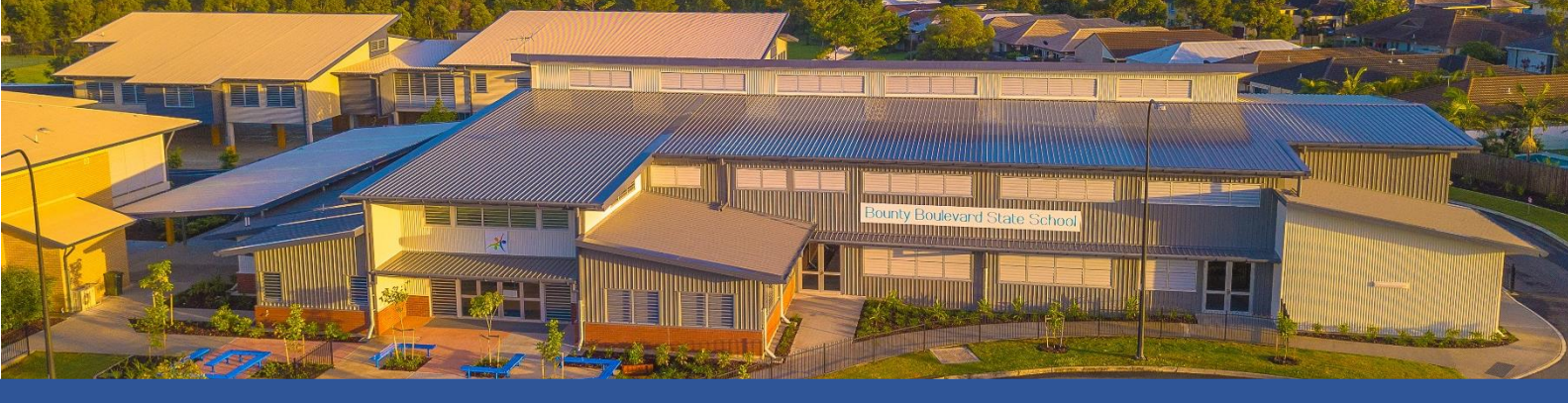
Term 1, Week 8 2024